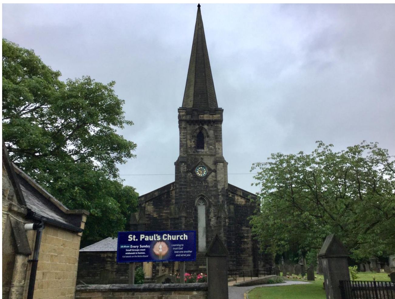
St. Paul's Churchyard, Birkenshaw

St. Paul's Churchyard, Birkenshaw contains 8 Commonwealth War Graves – 4 from World War 1 & 4 from World War 2.