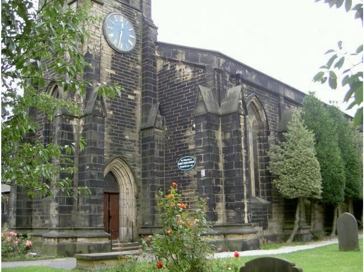
Photo of Cooks Mate W. Hare's Private Headstone in St. Paul's Churchyard, Birkenshaw, Yorkshire, England.