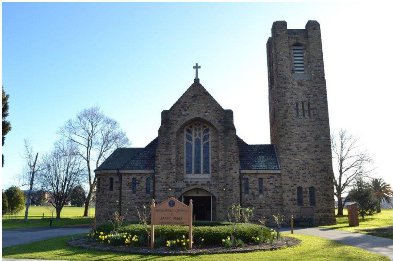
HMAS Cerberus Protestant Chapel of St Mark, Crib Point, Victoria