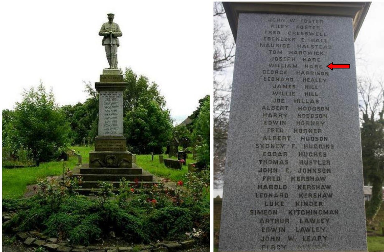
Tong War Memorial